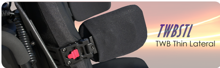
TWBSTL TWB Thin Lateral

The Worlds Best Laterals Series (TWB) are the most versatile laterals on the market. The TWBL can be used for thoracic (TWBL) and pelvic support (TWBADD) and come in a miniaturized (niño) pediatric version (TWBNL). These have the link hardware that can be adjusted to accommodate any size client by adding more links and swing out of the way for easy transfers. The added Full Surface Contact (FSC) feature takes this lateral to a whole new level by offering support on a 360° axis. It allows the pad to simulate a therapists hands by rotating to the curvatures of the body. If parts of the chair interfere with the swing away feature, then the SWINK option would give a second position for links to swing away.