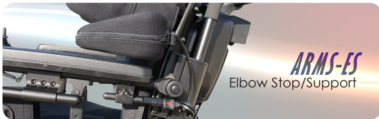
ARMS-ES Elbow Stop/Support

We also offer a sleeker thin style lateral (TWBTTL) and with additional link (TWBSTL) that have a slim line profile and reduced weight. The thoracic laterals mount with a after market track developed by Stealth Products for the Q6 Edge chair while the pelvic utilizes the tracks on the seat.