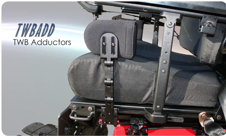
TWBADD TWB Adductors